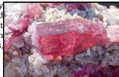
Pedeneira Mine, Sao Jose da Safira, Minas Gerais, Brazil

< http://www.gia.edu/gia-news-research-an-overview-of-2014-gia-brazil-expedition >