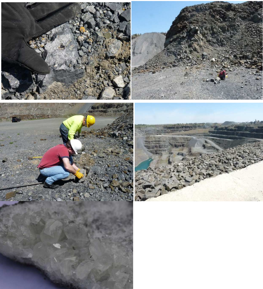
Manassas Quarry. Digging orange zeolite crystals on the floor of the -40 bench.

While Vulcan values the diabase for its weather resistance and toughness, a quality lacking in the sedimentary siltstones, rockhounds look for vugs and veins in the hornfels and the diabase. Prehnite, apophyllite, stilbite, stellerite, datolite, chabazite, chalcopyrite are popular finds in these vugs. Collectors found most of these minerals on this trip. On the “minus forty” level, we found some hornfels with the orange stilbite-stellerite-chabazite vugs embedded in the quarry floor. Others reported finding zeolites in the hornfels on the lower levels.